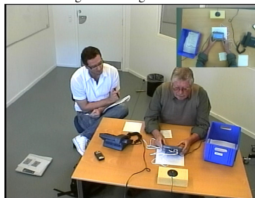
Figure 3. A test participant and the test monitor. The picture is from the video recording. The small picture in the upper right hand corner shows the interaction.

Data collection. All test sessions were recorded using video cameras and a microphone. The videos showed the HCS screen and a small picture in picture with the user's face, see Figure 3. We recorded a total of four hours of video. Two loggers made written log files during the tests.